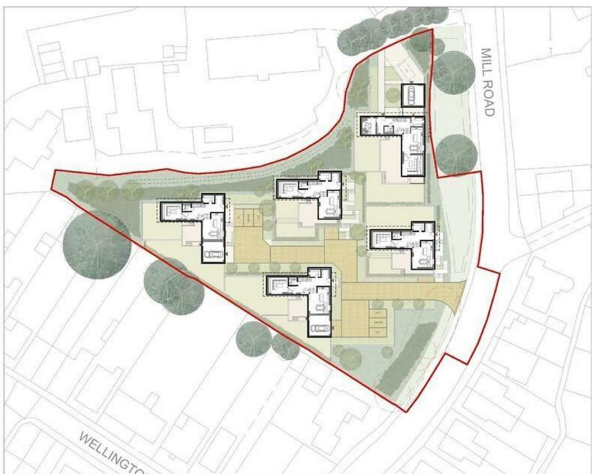
PROPOSED SITE PLAN (GROUND LEVEL)