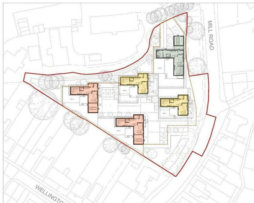
HOUSE TYPES PLAN